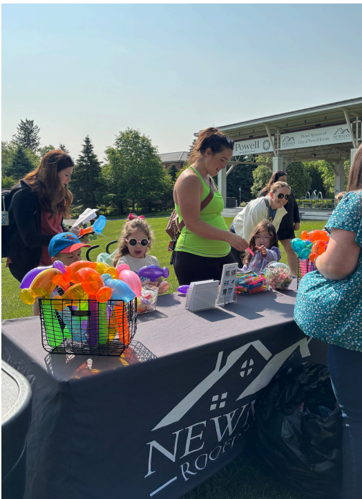
Table Vendor: $100 per event or $500 for all six