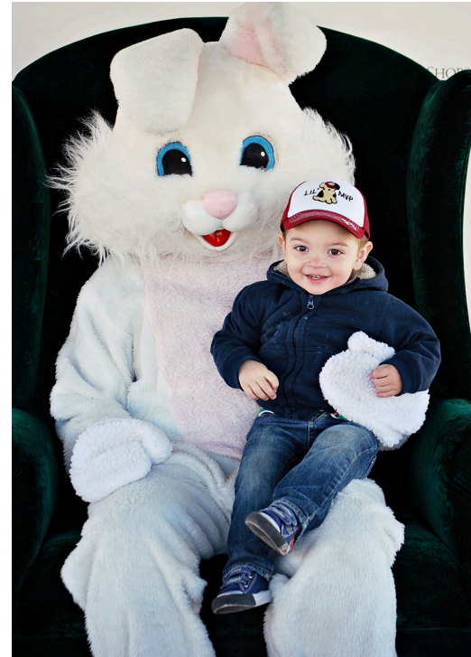
Photo opportunity with the Easter bunny. Each child receives a goodie bag and art project.